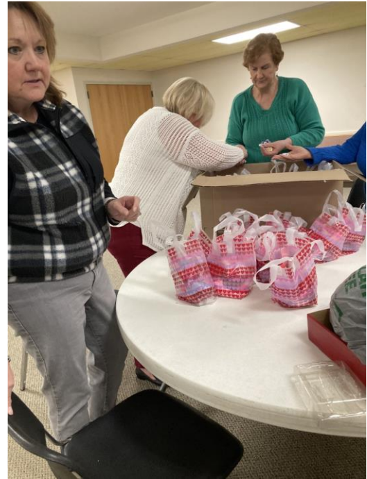
GFWC CREVE COEUR WOMEN'S CLUB PREPARING VALENTINE BAGS FOR THE GIRLS AT MISSOURI GIRLS TOWN

Therapists and staff work with us to improve and become better people.