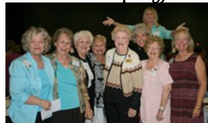
“All together now – ‘CHEESE’”