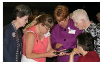
“How many GF members does it take to turn on a microphone?”