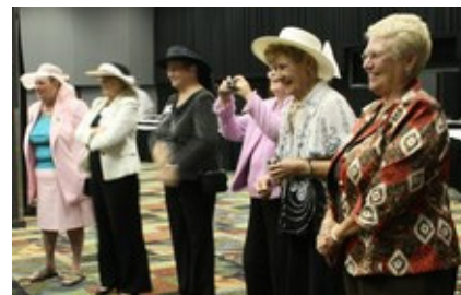
“Watching the Kentucky Derby?”