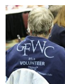
“GFWC Volunteers: friends enjoying one another and the work they do.”