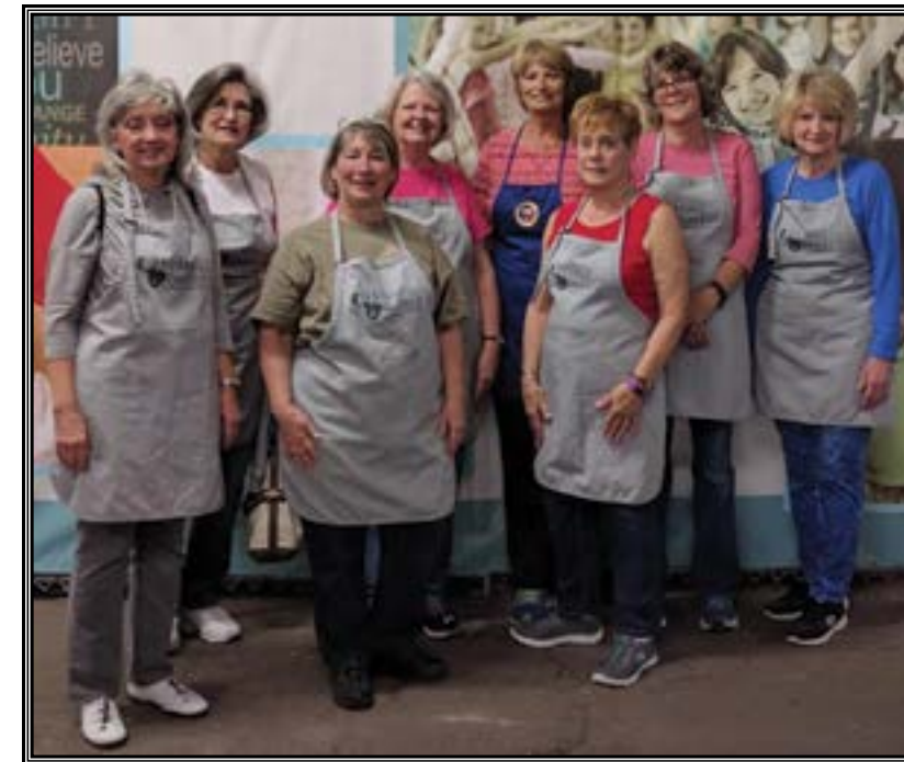
These are the smiling faces of GFWC Achieving by Reading Club members after packing hygiene products for shelters, churches, and schools at the Giving the Basics warehouse in the caves in Kansas City, Missouri.